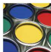
Paints and coatings