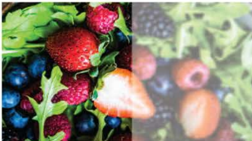
Viewed through material with low haze